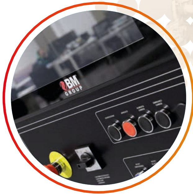
DRIVE SYSTEMS AND 4.0 AUTOMATION