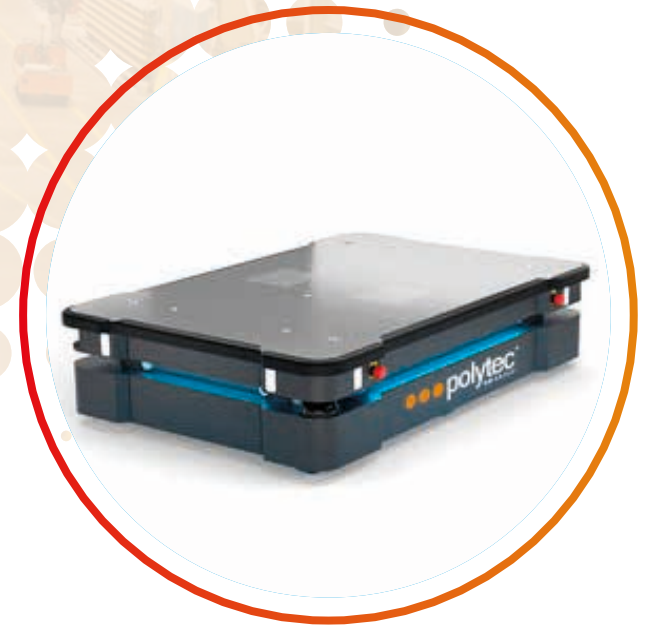
AGV AND SMART WAREHOUSES