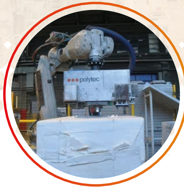
ROBOTICS AND COMPUTER VISION